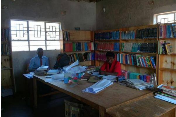
Teachers preparing lessons